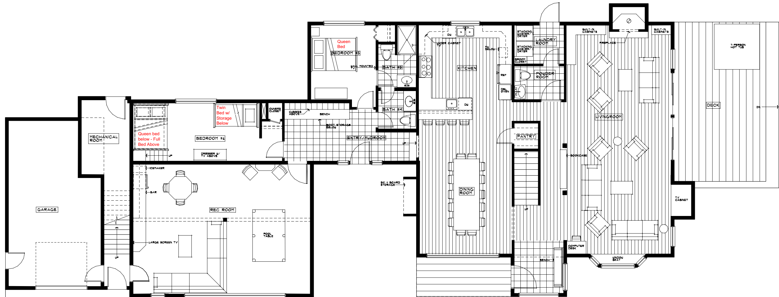
1 MAIN FLOOR PLAN AI 1/4"=1'-0" NORTH